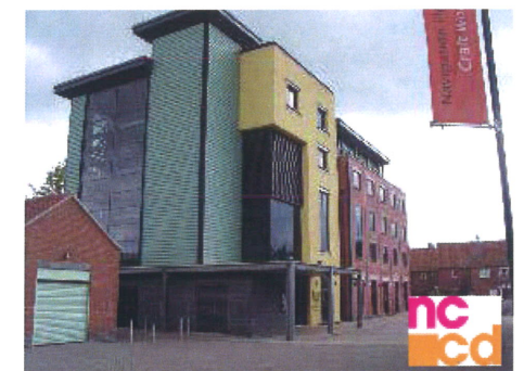
The National Centre for Craft and Design