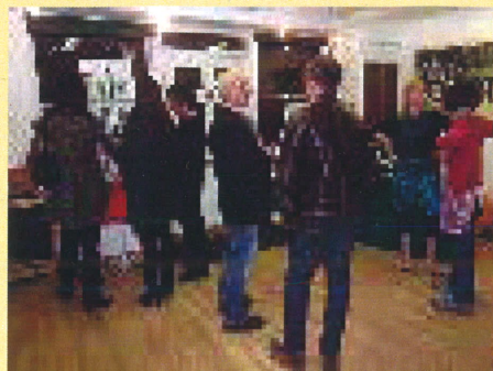
Group exhibition at Carre Gallery