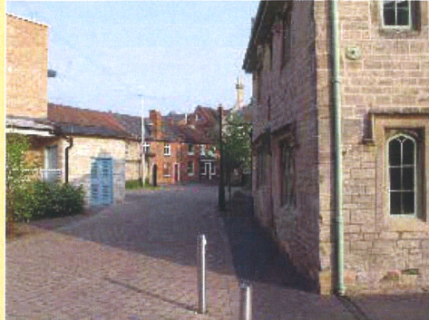
Carre Gallery from Navigation Yard

Lighting is both natural and artificial. The accommodation is centrally-heated and includes a kitchen, lavatories, store and studio. The Gallery is available for hire either as a whole or with separate lettings of certain rooms. Individual items of artwork are also accepted for display in occasional 'Open Exhibitions'.