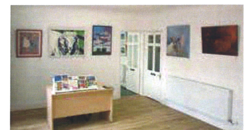
An exhibition at Carre Gallery