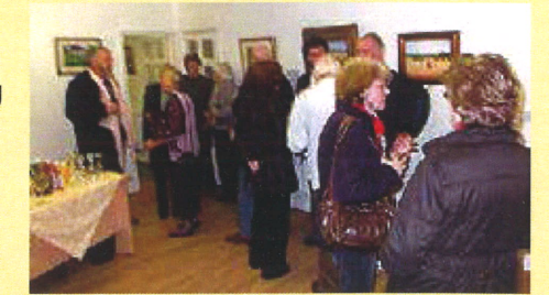
A Preview Evening at Carre Gallery

Hanging equipment is supplied by the gallery, together with basic catering equipment.